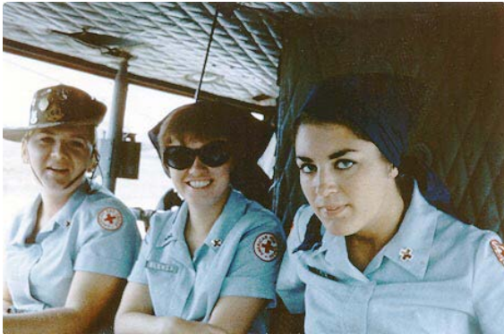
Red Cross "Donut Dollies"

Exclusive interviews with "Donut Dollies" serving with the Red Cross in Vietnam bring to this broadcast a unique and mostly untold story of these brave young women who were willing to sacrifice their lives for the purpose of lifting the morale of American combat soldiers. These frontline civilians, The Donut Dollies, also charmed the airwaves of the American Forces Vietnam Network with their own radio program which dedicated songs to wounded GIs they had visited in hospitals around the country.