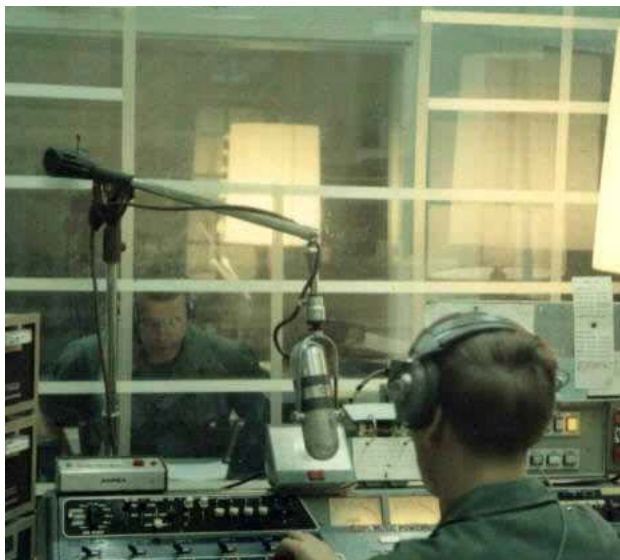
AFVN Sports Reports

The AFVN sports reports give football results for the Los Angeles Rams (now the St. Louis Rams), the St. Louis Cardinals (now the Arizona Cardinals), and the Baltimore Colts (now the Indianapolis Colts). Major League Baseball coverage refers to the Washington Senators (now the Texas Rangers) and Mickey Mantle's announcement that he would retire from the New York Yankees. The broadcast features coverage of Arnold Palmer and Gary Player at the two-man team match play at the 1968 Piccadilly World Match Play Championship at Wentworth near London (now the Volvo World Match Play Championship). Additional sports reports cover the upcoming 1968 Summer Olympics in Mexico City.