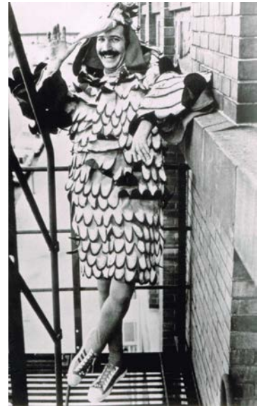
Dick Orkin ("Chickenman")

Chickenman (Dick Orkin) has been inducted into the National Radio Hall of Fame. Dick is the creator of the extraordinarily popular syndicated radio program "Chickenman." He has contributed an interview and original episodes that will play a prominent role in the total AFVN broadcast experience. Chickenman