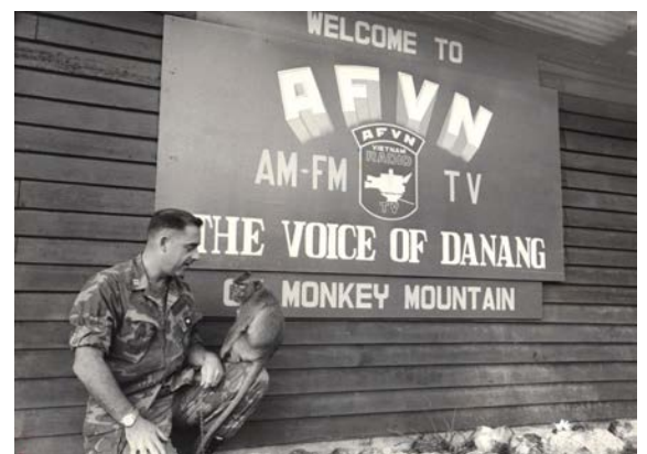
AFVN DANANG DETACHMENT #2 AM - FM - TV