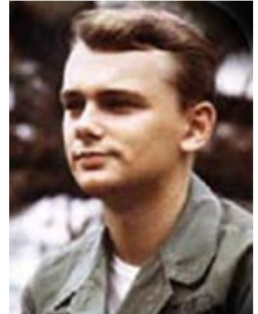
Army SP5 Pat Sajak

Hundreds of military personnel and civilians diligently served with AFVN on the air and behind the scenes to make it such an important and positive element of the Vietnam experience. It is the radio network where Adrian Cronauer signed on with "Goooooooood Morning, Vietnam" (which was the basis for the film "Good Morning, Vietnam" starring Robin Williams). Standout, Pat Sajak (of "Wheel of Fortune" fame) also served at AFVN-Saigon in 1968 and 1969. In April 1975, AFVN in Saigon famously played Irving Berlin's "White Christmas" as a signal for the remaining Americans that the final evacuation of Saigon had begun. The importance of the