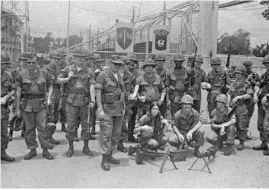
AFVN personnel in Vietnam

For the 3.4 million Americans who served in Vietnam and the surrounding theater during the war, AFVN (American Forces Vietnam Network) was the soundtrack of their lives while in Southeast Asia. AFVN disc jockeys, newsmen, sportscasters and special program hosts brought the sound of home to Vietnam. American servicemen, servicewomen, civilians and even South Vietnamese citizens regularly listened to AFVN for music, news, entertainment and other important information. AFVN was heard everywhere: on bases, aboard ships, in cockpits, and in the fields of battle. AFVN was with our troops on demand 24 hours a day throughout Vietnam and several other countries in the region. Wherever Americans were, AFVN accompanied them.