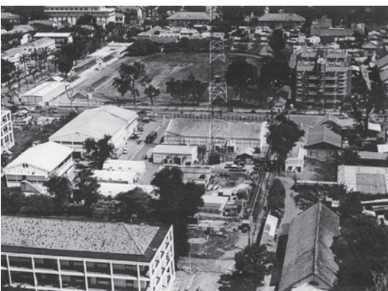
AFVN HEADQUARTERS SAIGON AM - FM - TV

THE CENTERPIECE OF THE PROGRAM WILL BE WHAT EVERY VIETNAM VETERAN REMEMBERS